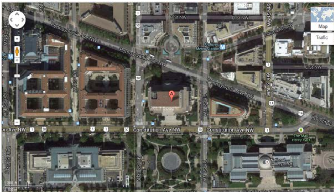
Street Map, NARA, 700 Pennsylvania Ave NW, Washington, DC

The National Archives Building is located between Seventh and Ninth Streets, NW, with entrances on Pennsylvania and Constitution Avenues.