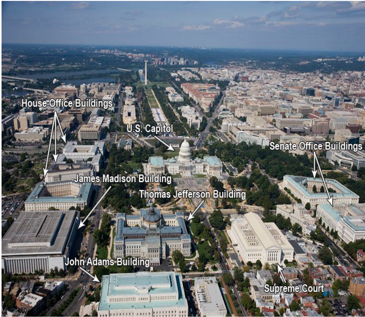
Aerial view of Library of Congress Buildings (James Madison, Thomas Jefferson, and John Adams)